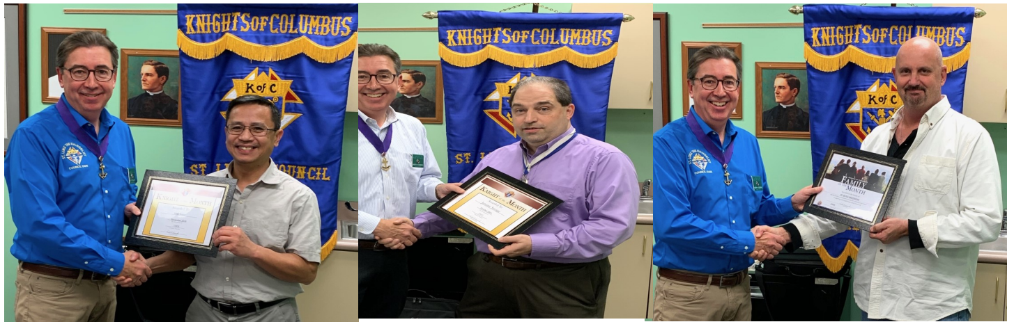
Knights of Month ( OCT & NOV) and Family of the Month (NOV) See Page 7