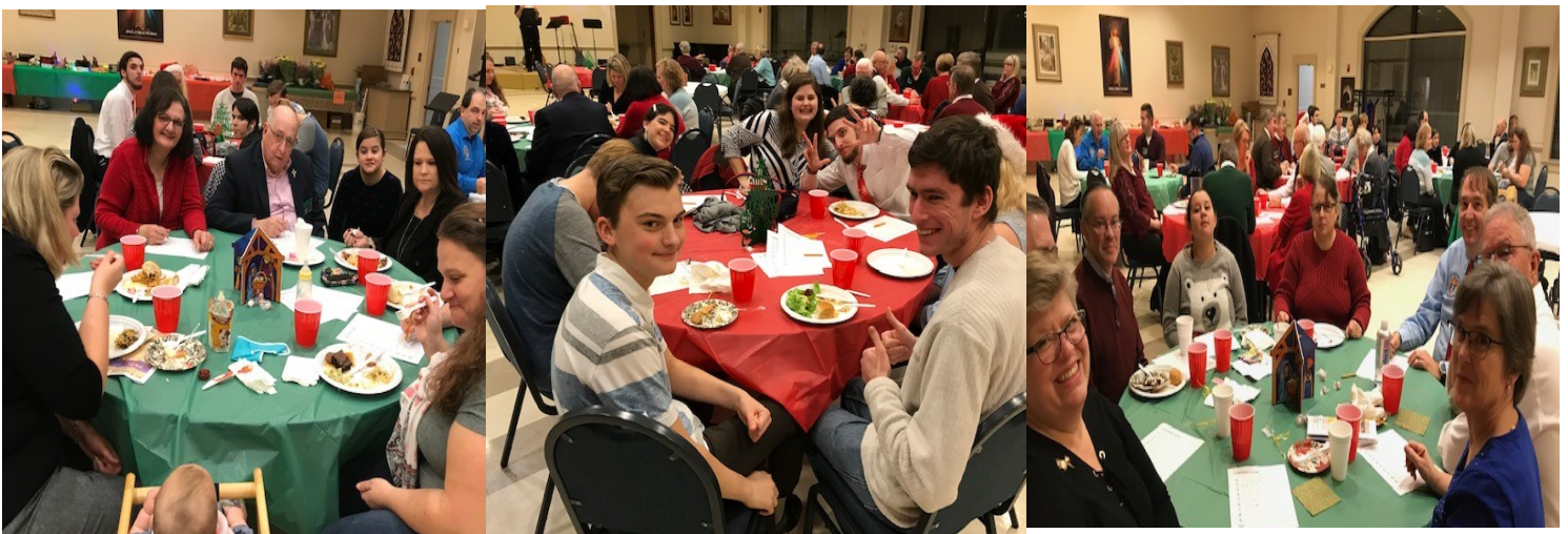
Jesus Birthday Celebration at Council Christmas Gathering