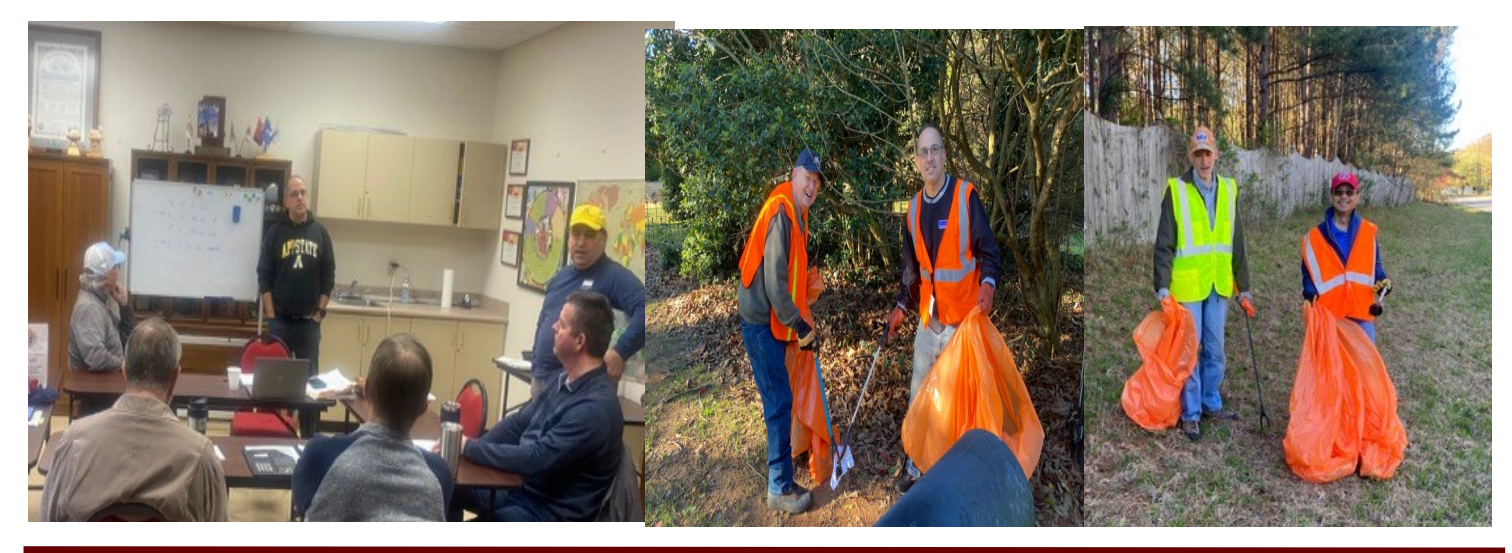
Adopt 6 Forks, March 4