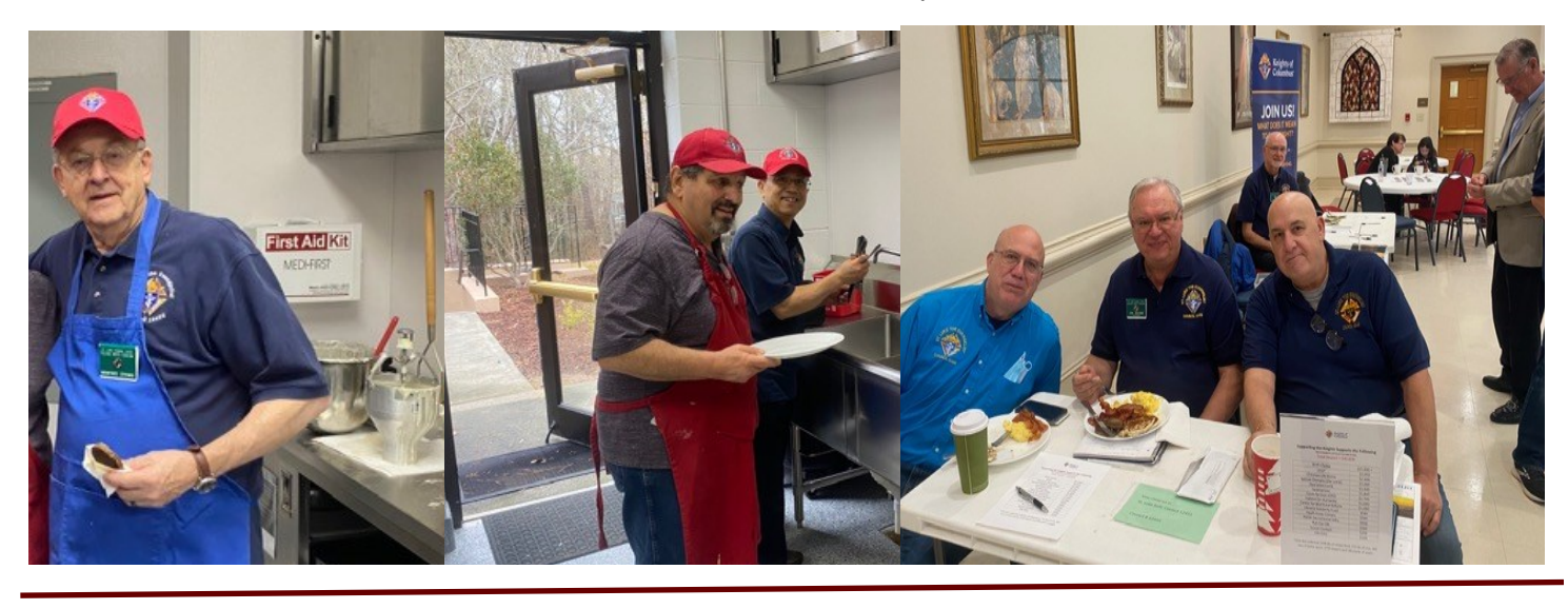
Doing the Work of the Council